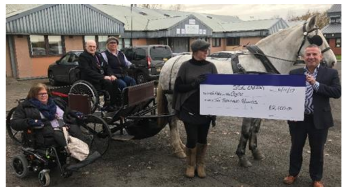
The Ark on the Clyde funding for accessible cart