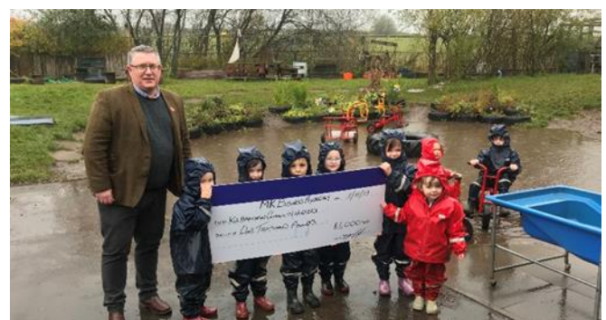
Kilbarchan Nursery funding for a play garden