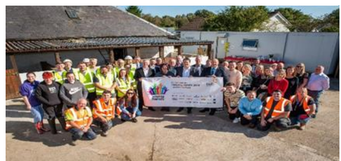
Lamont Farm DIY SOS